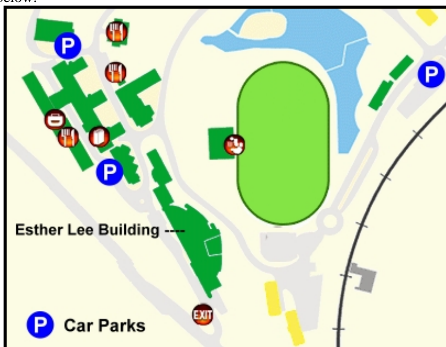
Map 4: Location of Car Parks in Chung Chi College

There are some parking spaces provided by the university. For the exact location please refer to map 4 below.