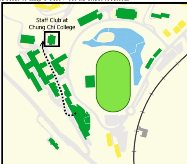
Map 1: Route from Esther Lee Building to Staff Club of Chung Chi College

The lunches on 12 th and 13 th December (12:20 to 13:45) will be served at the Staff Club of Chung Chi College of the university. It is in walking distance from Esther Lee Building. Our conference organizing committee and conference assistants will lead you to the dining location. Please refer to map 1 below for its exact location.